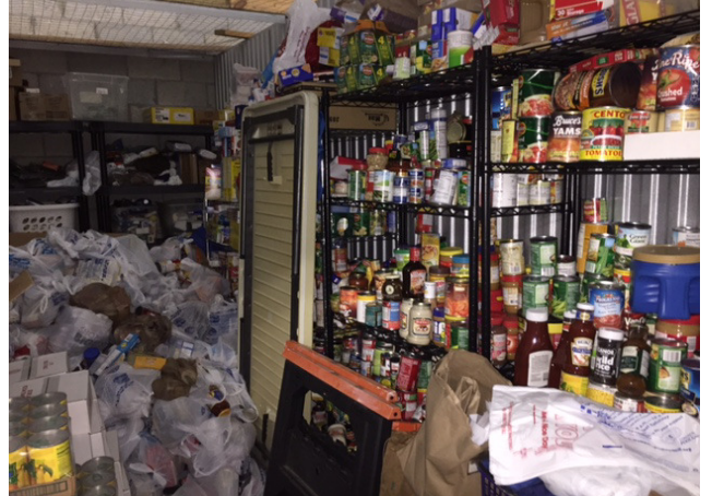
PANTRY STORAGE FOR HOMELESS VETS BY AMERICAN LEGION OF PT.ST.LUCIE