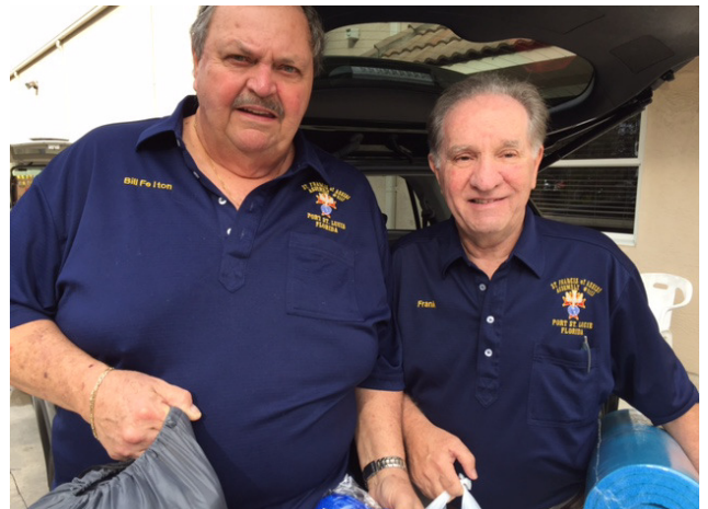
PSL AMER. LEGION AND 4 TH DEGREE AND BROTHERS OF ST. FRANCIS OF ASSISI